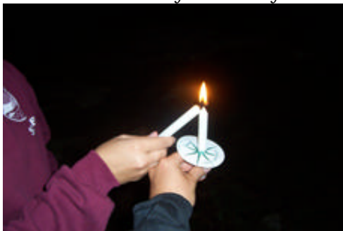
Candle Light Ceremony

Hey y'all! I went swimming at the beach today and it reminded me of all the fun times we had this summer!! I can't believe that it has been over a month since we packed up everything and closed camp! The leaves are starting to turn and I am sure that most of you are into your first month of school. It is funny that even after 14 years at camp, I start to miss it when I drive away on Willey Pond Road. Well, I hope