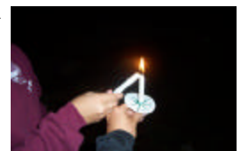
Candle Light Ceremony